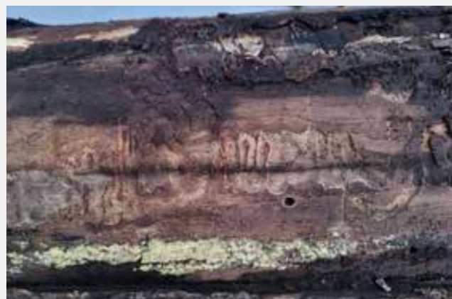
Emerald ash borer galleries in a Broadlands ash tree. The tree is now decomposing on the forest floor, providing nutrients too.

To get started, attend a Loudoun Invasive Removal Alliance (LIRA) invasive removal training like the one we are hosting in Broadlands on March 2nd. If