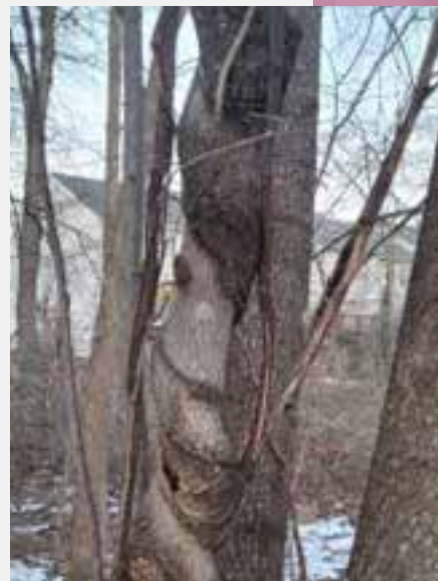
The shape of this tree trunk was created by a Japanese honeysuckle vine that has since been removed. Left alone, the vine would strangle the tree to death..

Leave the native vines and wear long gloves! Poison ivy ( Toxicodendron radicans ) like this one is dormant and the leaves are gone during the winter but its rash-causing oil is still present in the vines and roots all year. Virginia creeper ( Parthenocissus quinquefolia ), another native climbing vine, can also cause a rash even when leaves are gone during winter.