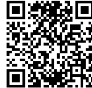
2026 Rec Pool Rental

To pay, visit www.broadlandshoa.org/pool , scroll down to Rec Pool Payment, and select the Pay Rec Pool Rental button. OR scan QR code.